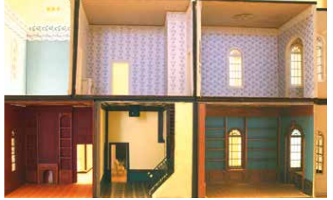
Hungerford Manor based on Belton House

Besides the quality of her work, the other thing which really appeals to me is that you can buy whole rooms full of a particular style of furniture. I often find it really frustrating to set off on a theme only to find I have to hunt all over the place to gather enough items together.